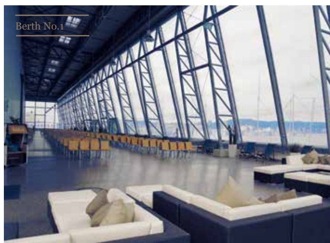
Berth No. 2