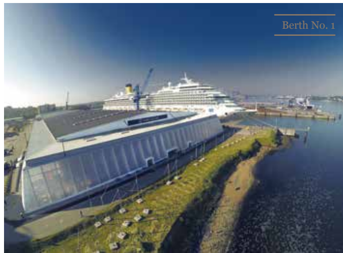
Berth No. 1